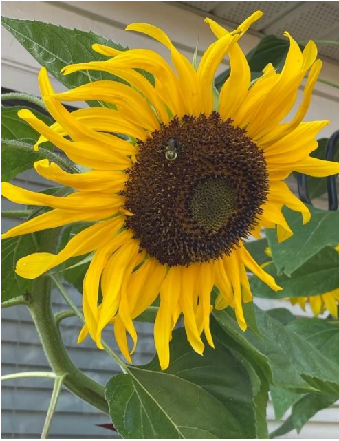
Sunflowers at Kathy Strohm's unit- 4617 Collingville Way