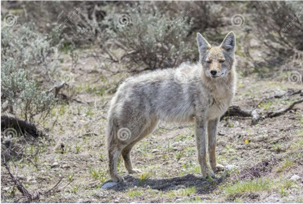
Example Photos from internet