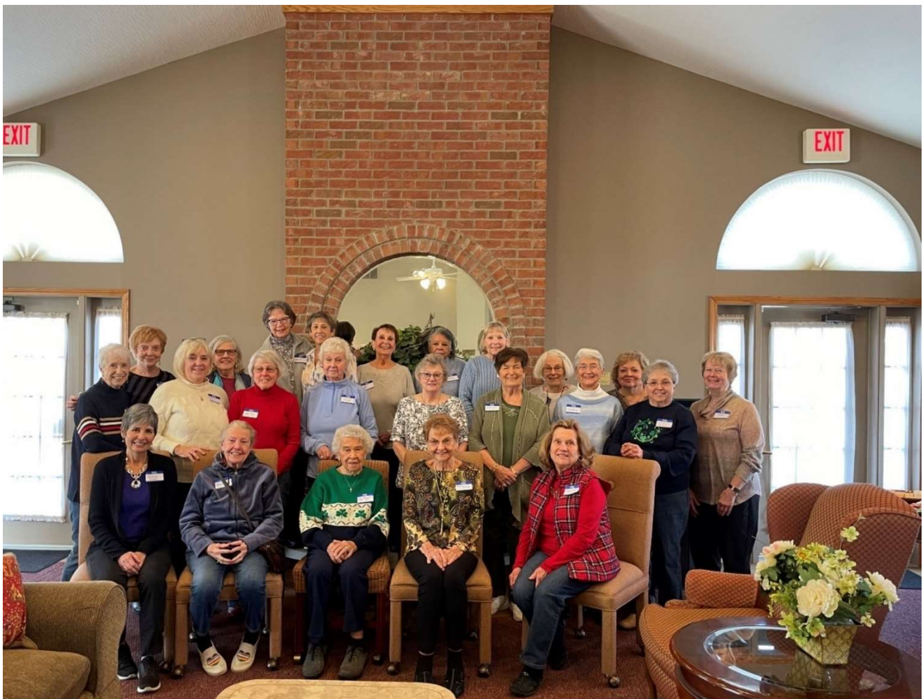
We're Back -- Ladies Monthly Coffee